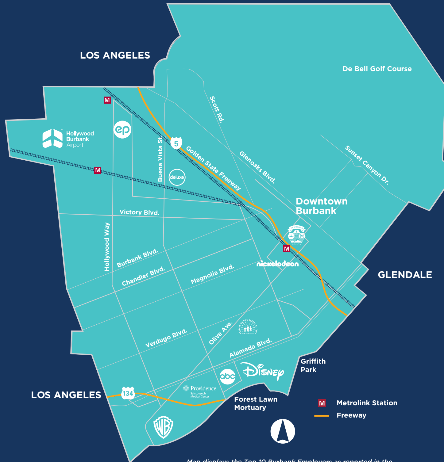
Map displays the Top 10 Burbank Employers as reported in the Burbank Business & Economic Development Annual Report 2022-2023

Looking ahead to 2023, this Legislative Platform clearly outlines the position of the City of Burbank on priority issues in the coming year, from responsible development to sustainability measures, as well as resources for innovative transit and clean energy projects. Drafted in consultation with the City’s state and federal advocacy firms, the Legislative Platform is intended to assist the Mayor, Council Members, and staff to proactively and appropriately address legislation that may impact the City’s ability to operate effectively, while allowing the consideration of additional legislative and budgetary issues that arise during the legislative session. With the Legislative Platform as a guiding document, the City will continue to work with its constituents, consultants, and elected representatives to promote and preserve the City’s interests at the local, state, and federal level.