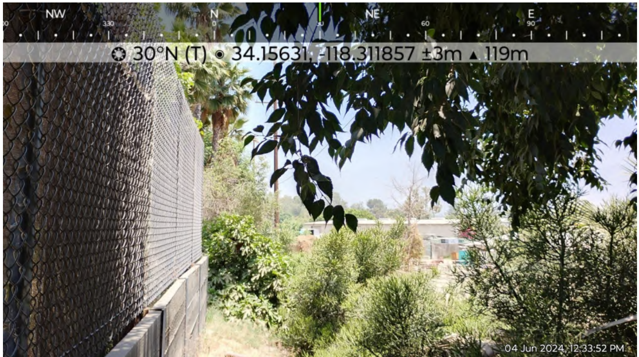
Photo 10. View of parcel from just beyond its eastern fence line, facing northeast.