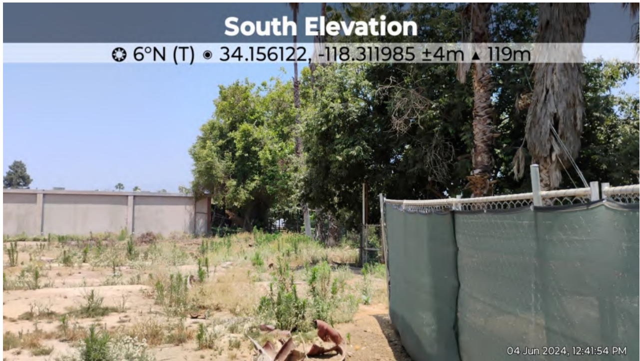
Photo 5. View of parcel backyard from near the southeast corner, facing northeast.