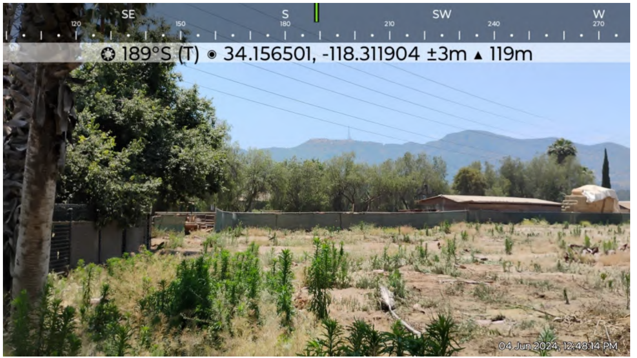
Photo 7. View of parcel backyard from near the near the northeast corner, facing southwest.