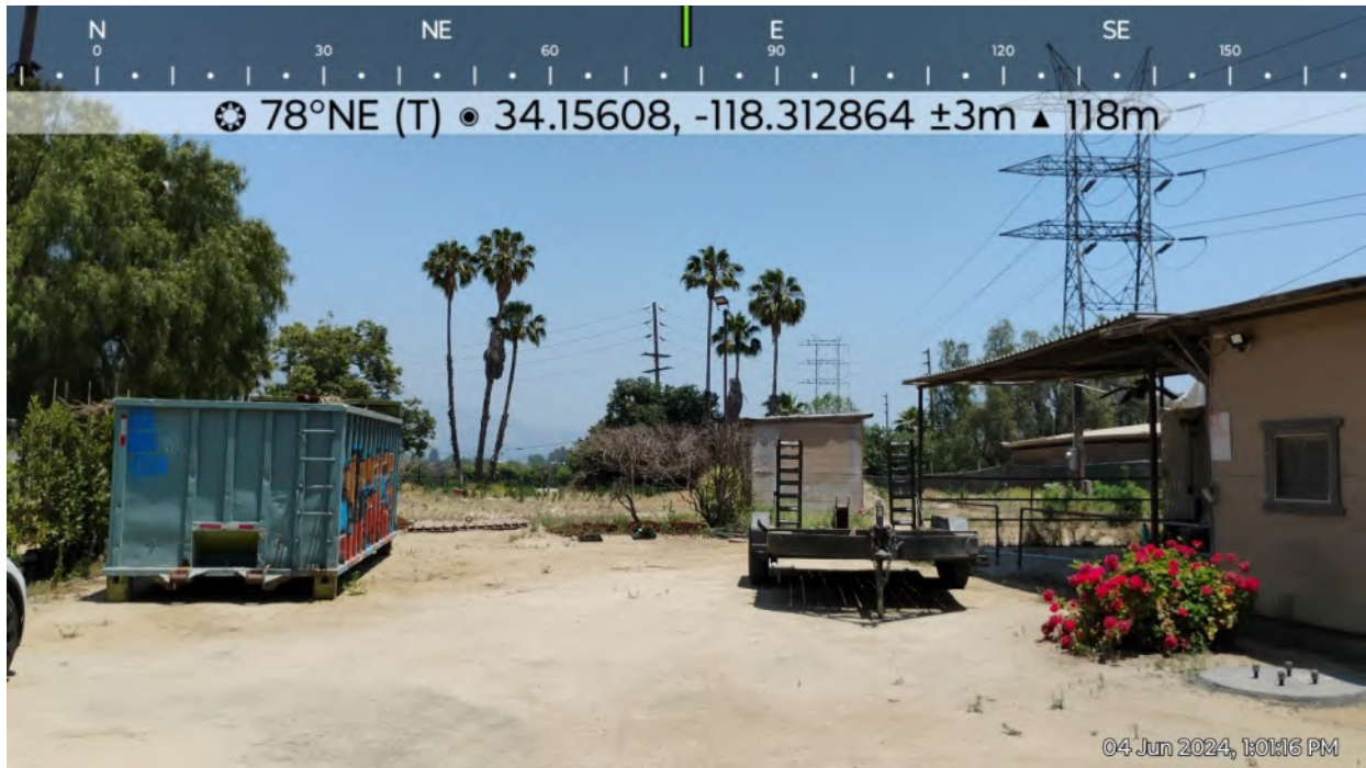
Photo 1. View of 910 S. Mariposa from the western boundary and just inside a fence line, facing east.