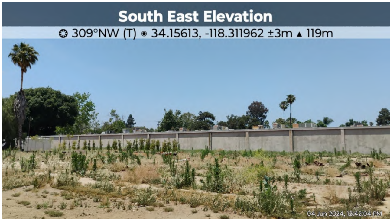
Photo 6. View of parcel backyard from near the southeast corner, facing northwest.