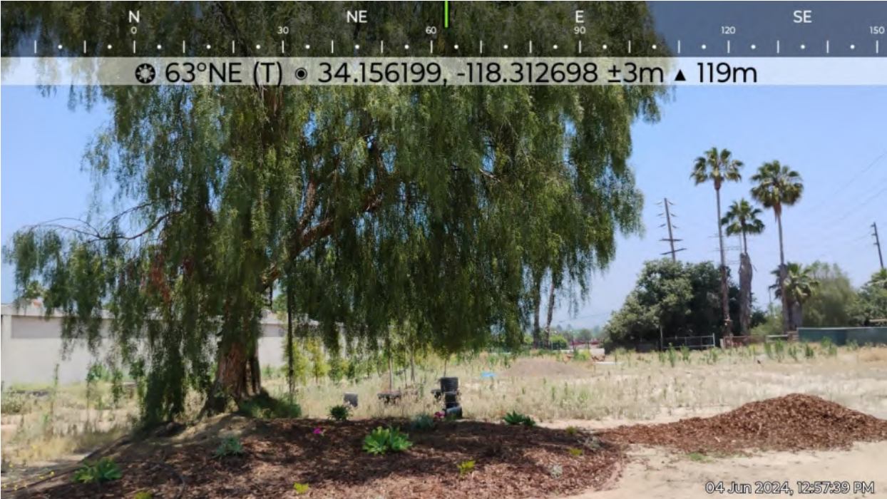
Photo 2. View of Peruvian pepper and ornamental landscaped area on western parcel, facing northeast/east.