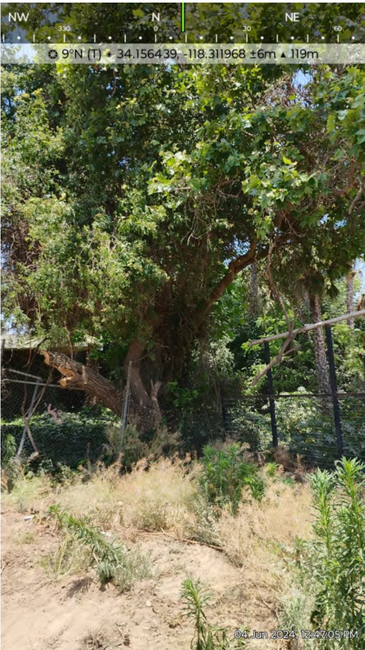
Photo 11. View of Mexican elderberry and western sycamore growing on property to the north, facing north.