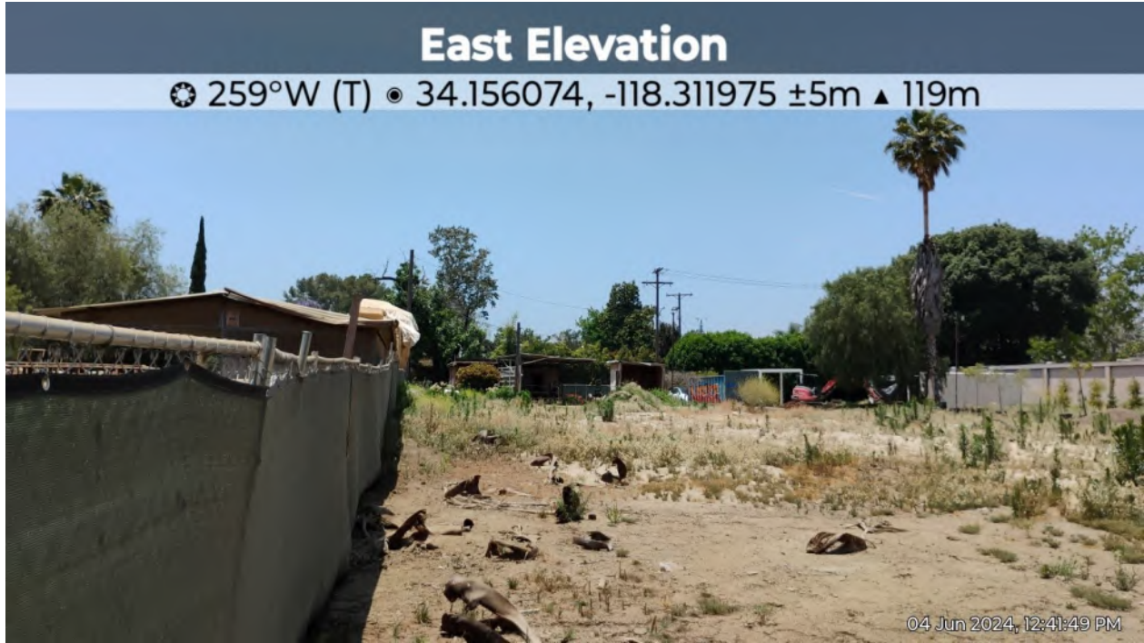
Photo 4. View of parcel backyard from near the southeast corner, facing west.