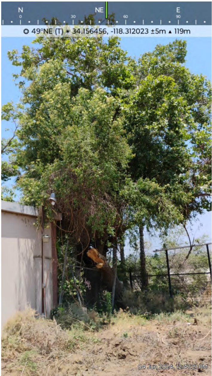
Photo 12. View of Mexican elderberry and western sycamore tree growing on property to the north, facing northeast.