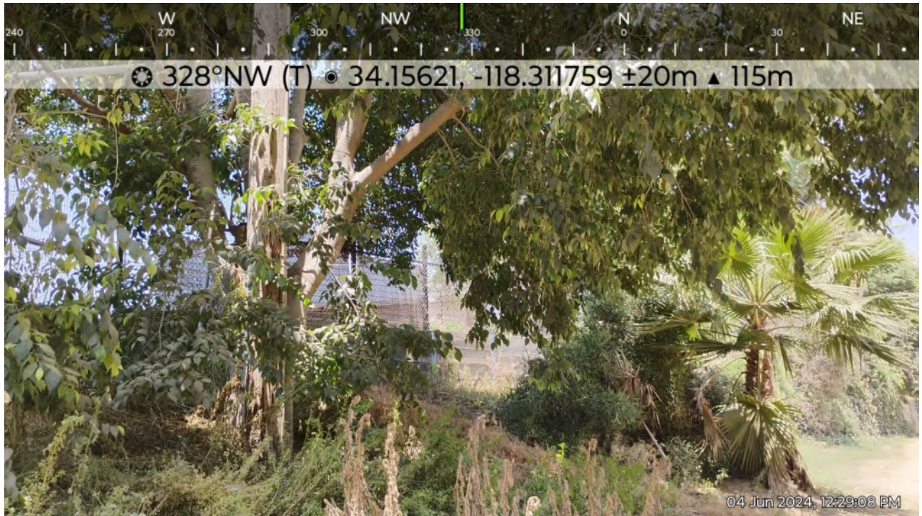
Photo 9. View from just beyond the southeast parcel boundary, facing northwest.