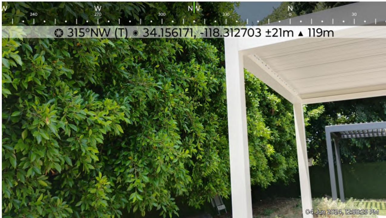
Photo 3. View of Chinese banyan along western fence line for the parcel, facing northwest.