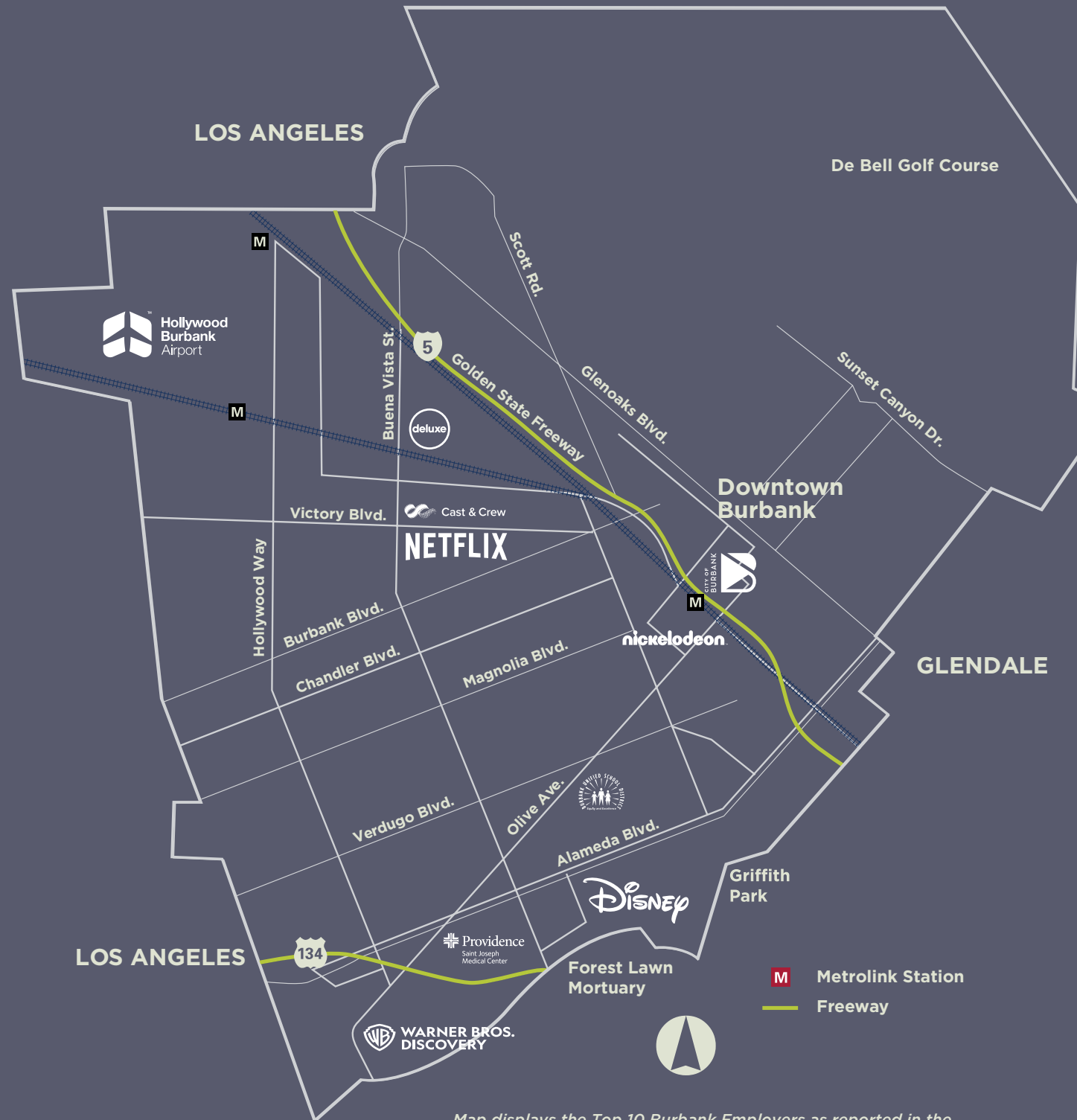
Map displays the Top 10 Burbank Employers as reported in the Burbank Business & Economic Development Annual Report 2023-2024

The 2024 Legislative Platform clearly outlines the position of the City of Burbank on priority issues in the coming year, from responsible development to sustainability measures, as well as resources for innovative transit and clean energy projects. Drafted in consultation with the City’s state and federal advocacy firms, the Legislative Platform is intended to assist the Mayor, Council Members, and staff to proactively and appropriately address legislation that may impact the City’s ability to operate effectively, while allowing the consideration of additional legislative and budgetary issues that arise during the legislative session. With the Legislative Platform as a guiding document, the City will continue to work with its constituents, consultants, and elected representatives to promote and preserve the City’s interests at the local, state, and federal level.