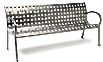
Chandler Bikeway Bench