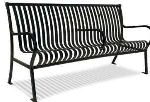
Park Bench (Plaque Included) *or similar bench