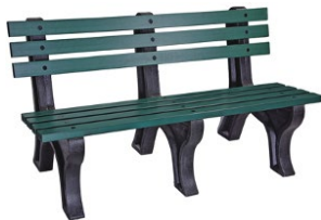
Debell Golf Course Bench (Plaque Included) *or similar bench