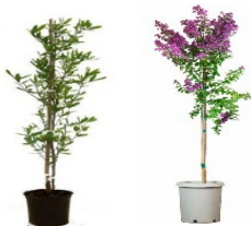
Park Tree (Certificate Included) *or similar tree